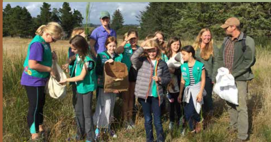
This Girl Scout troop from Astoria helped spread seed at Reed Ranch in September.

You have a fundraising event to plan. You have 2,600 envelopes to stuff and seal. You've invited 50 people to walk the Oregon Coast Trail with you and promised them snacks, guidance, and a good time. Who you gonna call? At NCLC, it's the Outreach Committee. More than a mere committee, this group has become the staff's go-to every time we reach out to the community or invite the public onto our lands. Enthusiastic, hard-working, smart, and committed to the mission: A land trust couldn't ask for better collaborators.