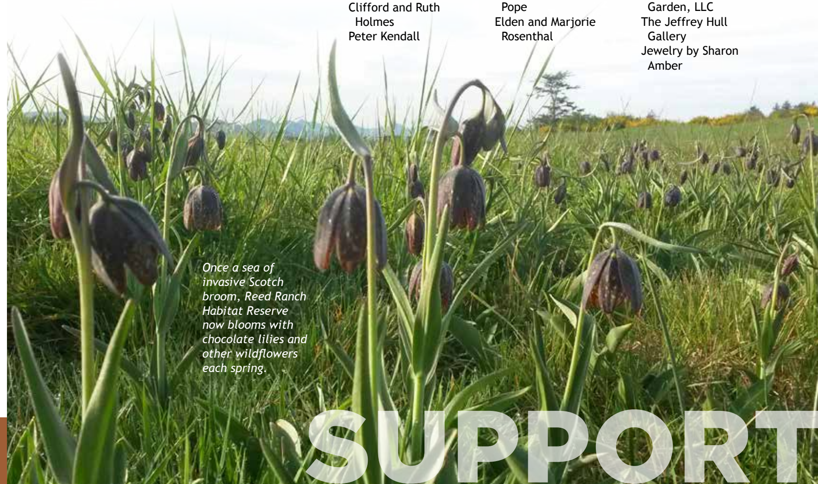
Once a sea of invasive Scotch broom, Reed Ranch Habitat Reserve now blooms with chocolate lilies and other wildflowers each spring.